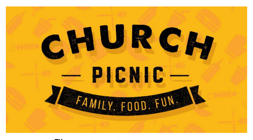
MAY 30<sup>TH</sup> FOLLOWING WORSHIP IN THE PARK